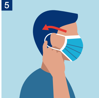
Place an ear loop around each ear or tie the top and bottom straps.