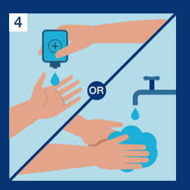
Perform hand hygiene.