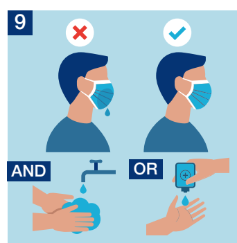
Replace the mask if it gets wet or dirty and wash your hands again after putting it on. Do not reuse the mask.