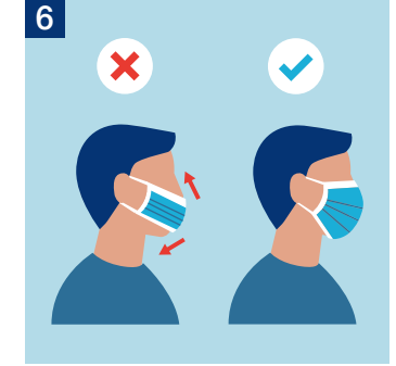
Cover mouth and nose fully, making sure there are no gaps. Pull the bottom of the mask to fully open and fit under your chin.