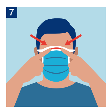
Press the metallic strip again to fit the shape of the nose. Perform hand hygiene.