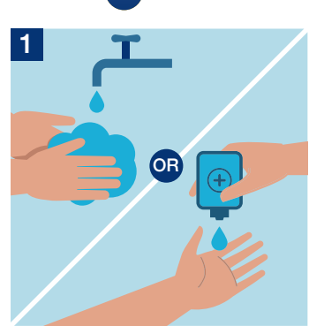
Wash your hands with soap and water for 20-30 seconds or perform hand hygiene with alcohol-based hand rub before touching the face mask.