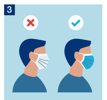
Ensure colour side of the mask faces outwards.